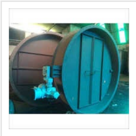
Multi Louver Damper