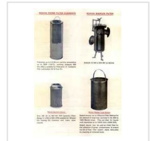
Industrial Filtration Units