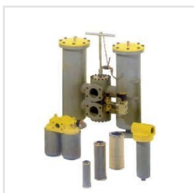
Pollution Duplex Strainer