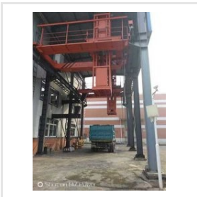
Stationary Truck Auger Sampler