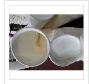
Polyester Filter Bag